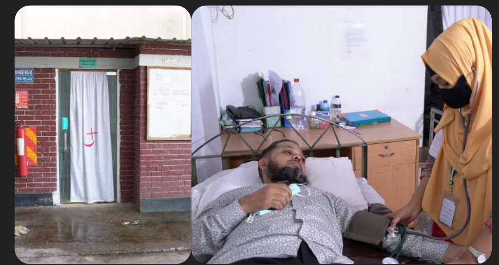
Health & Childcare Facility