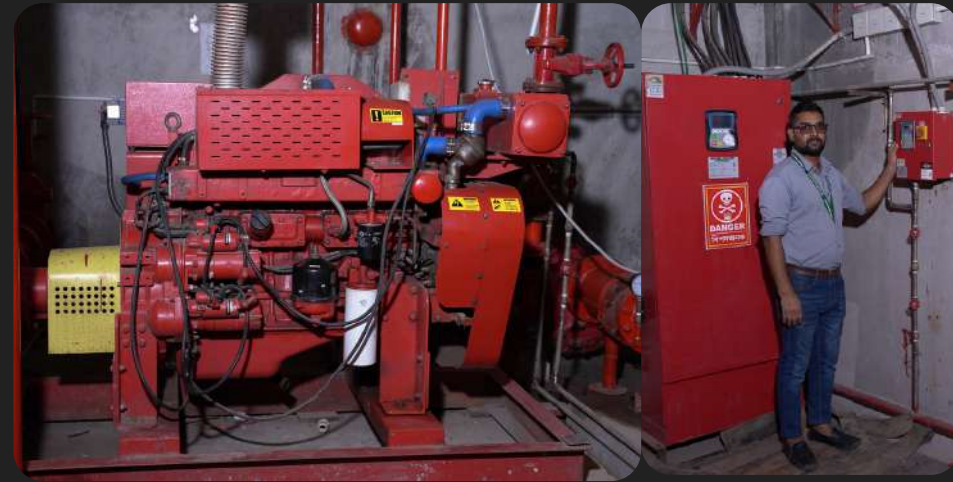
Fire Pump Room